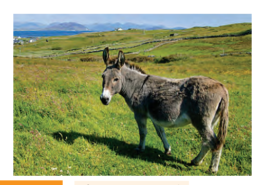
Figure 9.2 Mule

Controlled breeding experiments are carried out using artificial