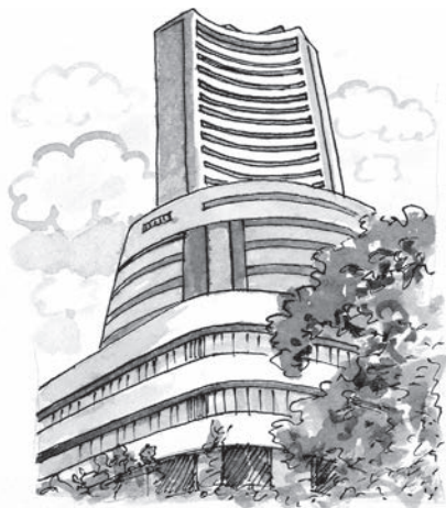
Bombay Stock Exchange