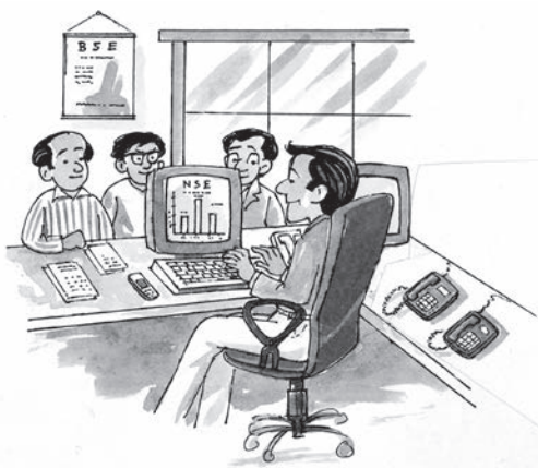
Electronic Trading System