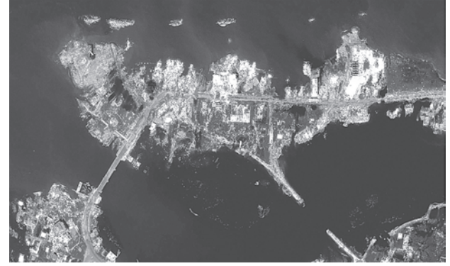
Do you know that cities can also grow negatively? Look at the photographs of this tsunami affected city. Are natural disasters the only reasons for negative growth in a city's size?

economic growth. This meant that the bigger the economy of the country, the more developed it was considered, even though this growth did not really mean much change in the lives of most people.