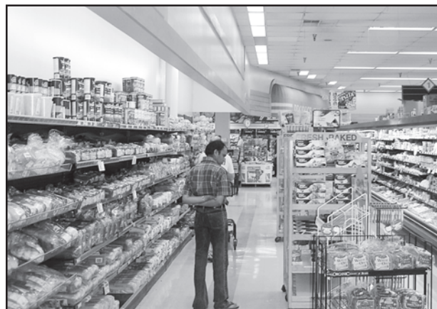
Fig. 7.3: Packed Food Market in U.S.A.

Urban marketing centres have more widely specialised urban services. They provide ordinary goods and services as well as many of the specialised goods and services required by people. Urban centres, therefore, offer manufactured goods as well as many specialised markets develop, e.g. markets for labour, housing, semi or finished products. Services of educational institutions and professionals such as teachers, lawyers, consultants, physicians, dentists and veterinary doctors are available.