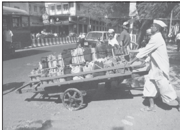
Fig. 7.4: Dabbawala Service in Mumbai

Personal services are made available to the people to facilitate their work in daily life. The workers migrate from rural areas in search of employment and are unskilled. They are employed in domestic services as housekeepers, cooks, and gardeners. This segment of workers is generally unorganised. One such example in India is Mumbai's dabbawala (Tiffin) service provided to about 1,75,000 customers all over the city.