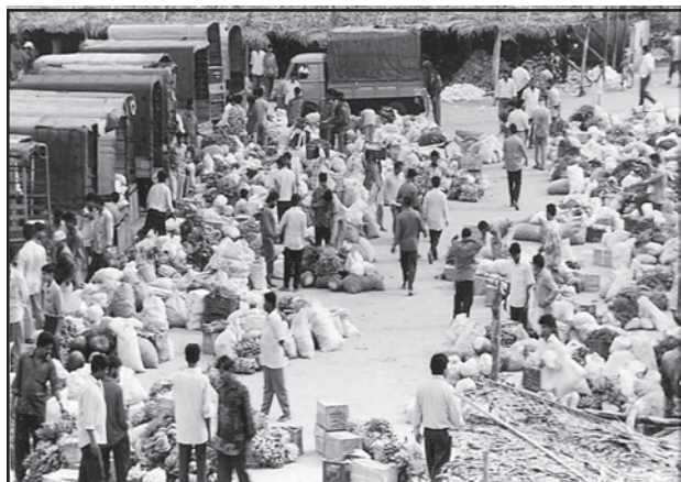
Fig. 7.2: A Wholesale Vegetable Market

Rural marketing centres cater to nearby settlements. These are quasi-urban centres. They serve as trading centres of the most rudimentary type. Here personal and professional services are not well-developed. These form local collecting and distributing centres. Most of these have mandis (wholesale markets) and also retailing areas. They are not urban centres per se but are significant centres for making available goods and services which are most frequently demanded by rural folk.