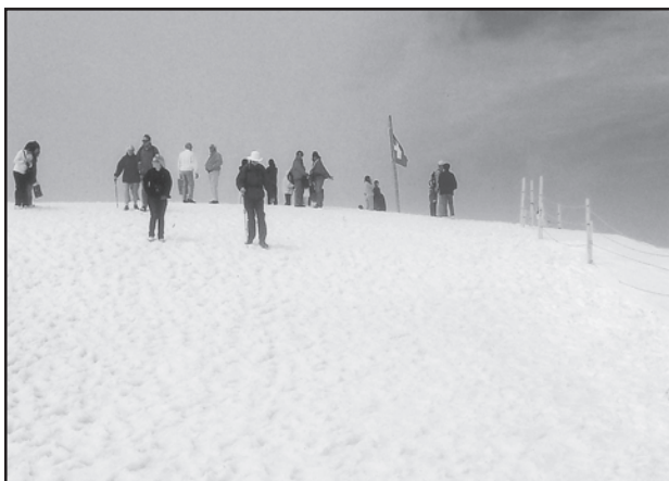
Fig. 7.5: Tourists skiing in the snow capped mountain slopes of Switzerland

Tourism is travel undertaken for purposes of recreation rather than business. It has become the world's single largest tertiary activity in total registered jobs (250 million) and total revenue (40 per cent of the total GDP). Besides, many local persons, are employed to provide services like accommodation, meals, transport, entertainment and special shops serving the tourists. Tourism fosters the growth of infrastructure industries, retail trading, and craft industries (souvenirs). In some regions, tourism is seasonal because the vacation period is dependent on favourable weather conditions, but many regions attract visitors all the year round.