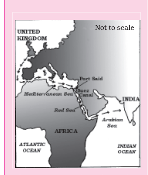
Fig.1.2 Suez Canal: Used as highway between India and Britain

Various details about the population of British India were first collected through a census in 1881. Though suffering from certain limitations, it revealed the unevenness in India's population growth. Subsequently,