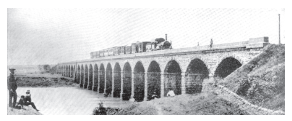
Fig. 1.4 First Railway Bridge linking Bombay with Thane, 1854

Indian people gained owing to the introduction of the railways, were thus outweighed by the country's huge economic loss.