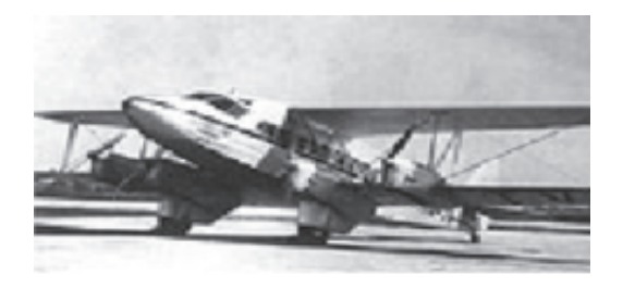
Fig.1.5 Tata Airlines, a division of Tata and Sons, was established in 1932 inaugurating the aviation sector in India

Along with the development of roads and railways, the colonial dispensation also took measures for developing the inland trade and sea lanes. However, these measures were far from satisfactory. The inland waterways, at times, also proved uneconomical as in the case of the Coast Canal on the Orissa coast. Though the canal was built at a huge