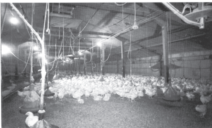
Fig. 6.4 Poultry has the largest share of total livestock in India

However problems related to over- fishing and