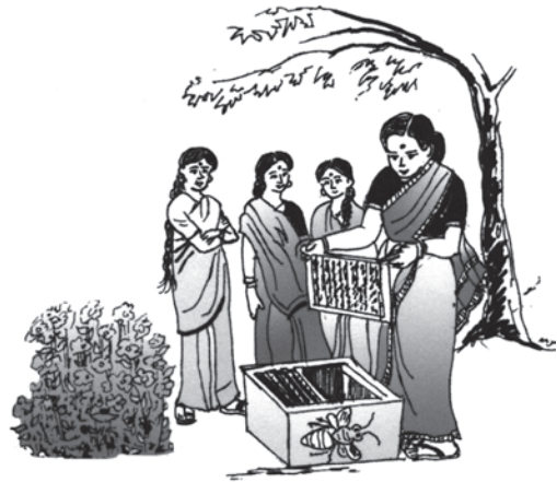
Fig. 6.5 Women in rural households take up bee-keeping as an entrepreneurial activity

Horticulture: Blessed with a varying climate and soil conditions, India has adopted growing of diverse horticultural crops such as fruits, vegetables, tuber crops, flowers, medicinal and aromatic plants, spices and plantation crops. These crops play a vital role in providing food and nutrition, besides addressing employment concerns. Horticulture sector contributes nearly one-third of the value of agriculture output and six per cent of Gross Domestic Product of India. India has emerged as a world leader in producing a variety of fruits like mangoes, bananas, coconuts, cashew nuts and a number of spices and is the second largest producer of fruits and vegetables. Economic condition of many farmers engaged in horticulture has improved and it has become a means of improving livelihood for many unprivileged classes. Flower