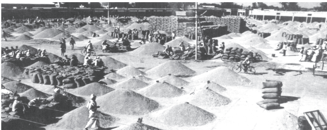
Fig. 6.1 Regulated market yards benefit farmers as well as consumers

Let us discuss four such measures that were initiated to improve the marketing aspect. The first step was regulation of markets to create orderly and transparent marketing conditions. By and large, this policy benefited farmers as well as consumers. However, there is still a need to develop about 27,000 rural periodic markets as regulated market places to realise the full potential of rural markets. Second component is provision of physical infrastructure facilities like roads, railways, warehouses, godowns, cold storages and processing units. The current infrastructure facilities are quite inadequate to meet the growing demand and need to be improved. Cooperative