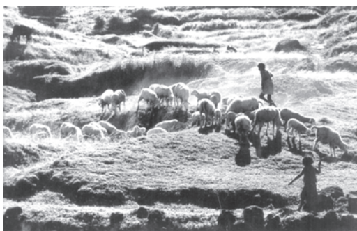
Fig. 6.3 Sheep rearing — an important income augmenting activity in rural areas

followed by others. Other animals which include camels, asses, horses, ponies and mules are in the lowest rung. India had about 300 million cattle, including 108 million buffaloes in 2012. Performance of the Indian dairy sector over the last three decades has been quite impressive. Milk production in the country has increased by about ten times between 1951-2016. This can be attributed mainly to the successful implementation of 'Operation Flood'. It is a system whereby all the farmers can pool their milk produced according to different grading (based on quality) and the same is processed and marketed to urban centres through cooperatives. In this system the farmers are assured of a fair price and income from the supply of milk to urban markets. As pointed out earlier Gujarat state is held as a success story in the efficient implementation of milk cooperatives which has been emulated by many states. Gujarat, Madhya Pradesh, Uttar Pradesh, Andhra Pradesh, Maharashtra, Punjab and Rajasthan, are major milk producing states. Meat,