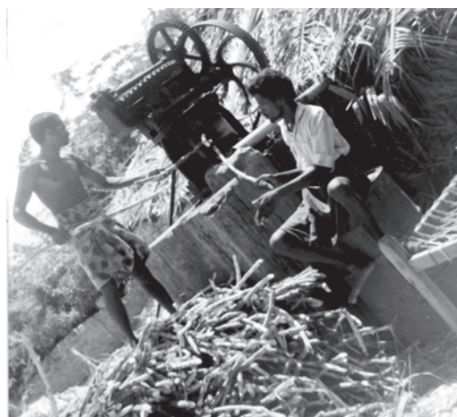
Fig. 6.2 Jaggery making is an allied activity of the farming sector

As agriculture is already overcrowded, a major proportion of the increasing labour force needs to find alternate employment opportunities in other non-farm sectors. Non-farm economy has several segments in it;