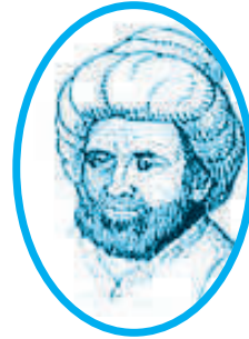
Muhammad ibn Musa al-Khwarizmi (C.E. 780 – 850)

A lemma is a proven statement used for proving another statement.