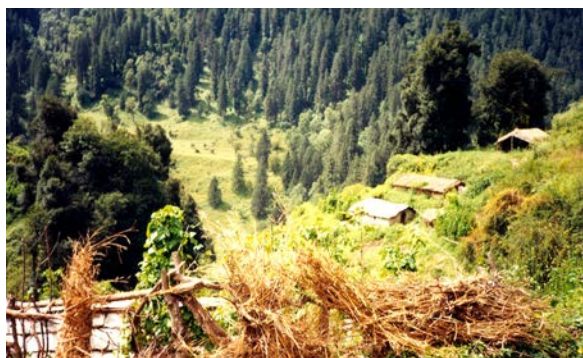
Figure 16.2 A view of a forest life

Do you think such use of forest resources would lead to the exhaustion of these resources? Do not forget that before the British came and took over most of our forest areas, people had been living in these forests for centuries. They had developed practices to ensure that the resources were used in a sustainable manner. After the British took control of the forests (which they exploited ruthlessly for their own purposes), these people were forced to depend on much smaller areas and forest resources started becoming over-exploited to some extent. The Forest Department in independent India took over from the British but local knowledge and local needs continued to be ignored in the management practices. Thus vast tracts of forests have been converted to monocultures of pine, teak or eucalyptus. In order to plant these trees, huge areas are first cleared of all vegetation. This destroys a large amount of biodiversity in the area. Not only this, the varied needs of the local people – leaves for fodder, herbs for medicines, fruits and nuts for food – can no longer be met from such forests. Such plantations are useful for the industries to access specific products and are an important source of revenue for the Forest Department.