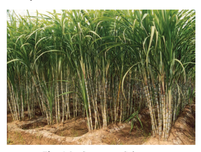
Fig. 4.8: Sugarcane Cultivation

Sugarcane: It is a tropical as well as a subtropical crop. It grows well in hot and humid climate with a temperature of 21°C to 27°C and an annual rainfall between 75cm. and 100cm. Irrigation is required in the regions of low rainfall. It can be grown on a variety of soils and needs manual labour from