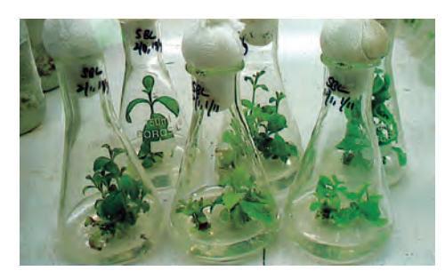
Fig. 4.16: Tissue culture of teak clones

countries because of the highly subsidised agriculture in those countries.