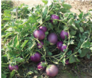
Fig. 4.13: Cultivation of vegetables – peas, cauliflower, tomato and brinjal