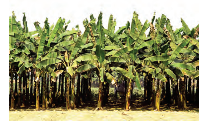
Fig. 4.2: Banana plantation in Southern part of India

In India, tea, coffee, rubber, sugarcane, banana, etc., are important plantation crops. Tea in Assam and North Bengal coffee in Karnataka are some of the important plantation crops grown in these states. Since the production is mainly for market, a well-developed network of transport and communication connecting the plantation areas, processing industries and markets plays an important role in the development of plantations.