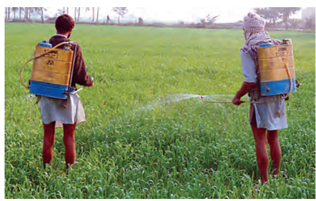
Fig. 4.17 Problems associated with heavy pesticide use are widely recognised in developed and developing countries

A few economists think that Indian farmers have a bleak future if they continue growing foodgrains on the holdings that grow smaller