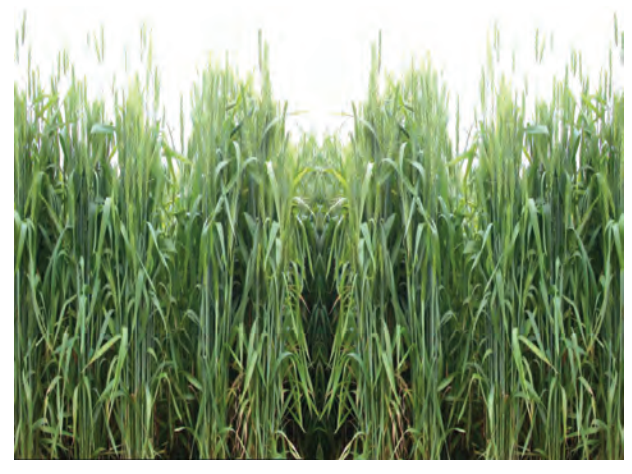
Fig. 4.5: Wheat Cultivation

Wheat: This is the second most important cereal crop. It is the main food crop, in north and north-western part of the country. This rabi crop requires a cool growing season and a bright sunshine at the time of ripening. It requires 50 to 75 cm of annual rainfall evenly-distributed over the growing season. There are two important wheat-growing zones in the country – the Ganga-Satluj plains in the north-west and black soil region of the Deccan. The major wheat-producing states are Punjab, Haryana, Uttar Pradesh, Madhya Pradesh, Bihar and Rajasthan.