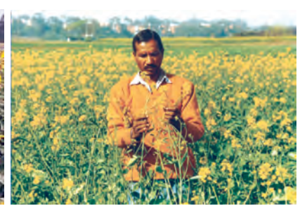
Fig. 4.9: Groundnut, sunflower and mustard are ready to be harvested in the field