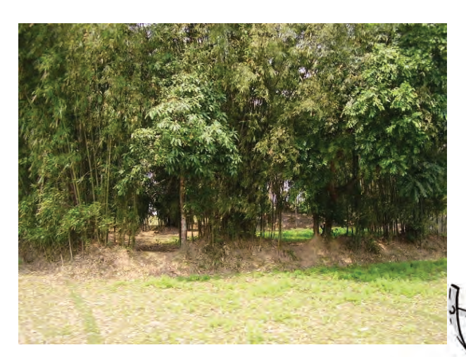
Fig. 4.3: Bamboo plantation in North-east