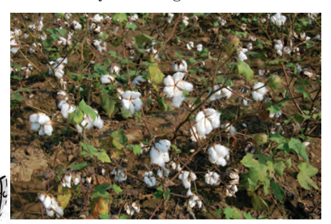
Fig. 4.14: Cotton Cultivation

Cotton: India is believed to be the original home of the cotton plant. Cotton is one of the main raw materials for cotton textile industry. In 2016, India was second largest producer of cotton after China. Cotton grows well in drier parts of the black cotton soil of the Deccan plateau. It requires high temperature, light rainfall or irrigation, 210 frost-free days and bright sun-shine for its