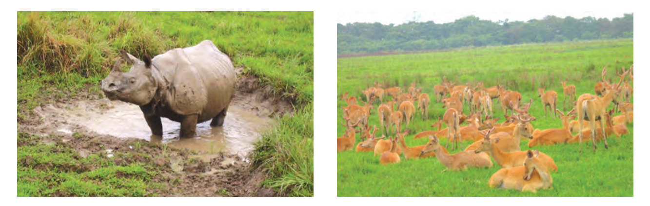
Fig. 2.4: Rhino and deer in Kaziranga National Park

dwindled to 1,827 from an estimated 55,000 at the turn of the century. The major threats to tiger population are numerous, such as poaching for trade, shrinking habitat, depletion of prey base species, growing human population, etc. The trade of tiger skins and the use of their bones in traditional medicines, especially in the Asian countries left the tiger population on the verge of extinction. Since India and Nepal provide habitat to about two-thirds of the surviving tiger population in the world, these two nations became prime targets for poaching and illegal trading.