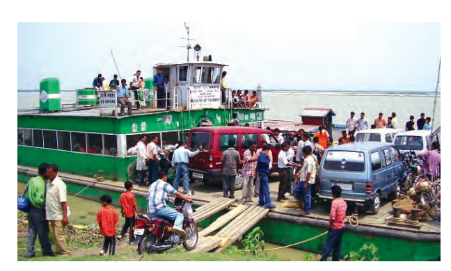
Fig. 7.5: Inland waterways widely used in north-eastern states