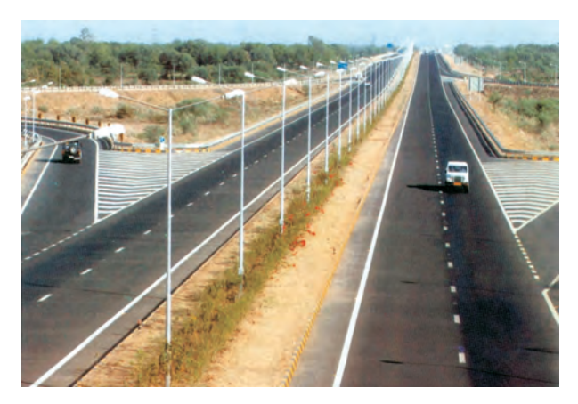
Fig.7.2: Ahmedabad-Vadodara Expressway

laid and maintained by the Central Public Works Department (CPWD). A number of major National Highways run in North-South and East-West directions. The historical Sher-Shah Suri Marg is called National Highway No.1, between Delhi and Amritsar.