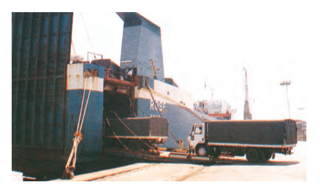
Fig. 7.6: Trucks being driven into the vessel at Mumbai port

Deendayal Port, is a tidal port. It caters to the convenient handling of exports and imports of highly productive granary and industrial belt stretching across the states of Jammu and Kashmir, Himachal Pradesh, Punjab, Haryana, Rajasthan and Gujarat.