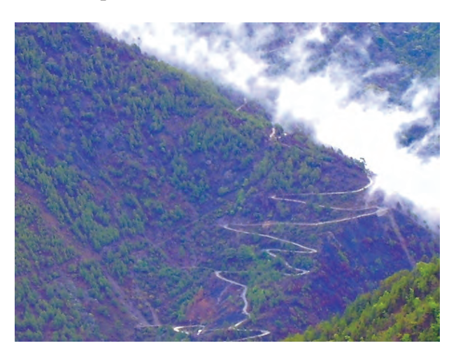
Fig. 7.3: Hilly Tracts

maintains roads in the bordering areas of the country. This organisation was established in 1960 for the development of the roads of strategic importance in the northern and north-eastern border areas. These roads have improved accessibility in areas of difficult terrain and have helped in the economic development of these area.