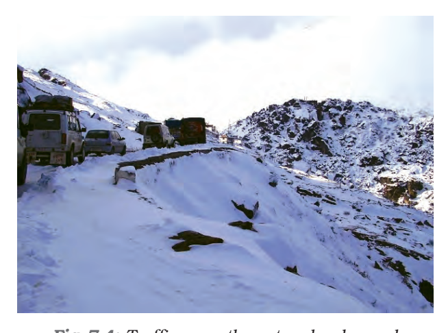
Fig. 7.4: Traffic on north-eastern border road (Arunachal Pradesh)

Roads can also be classified on the basis of the type of material used for their construction such as metalled and unmetalled roads. Metalled roads may be made of cement, concrete or even bitumen of coal, therefore, these are all weather roads. Unmetalled roads go out of use in the rainy season.