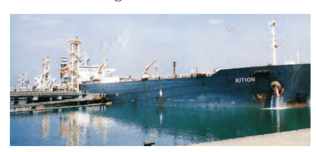
Fig. 7.7: Tanker discharging crude oil at New Mangalore port

Mumbai is the biggest port with a spacious natural and well-sheltered harbour. The Jawaharlal Nehru port was planned with a view to decongest the Mumbai port and serve as a hub port for this region. Marmagao port (Goa) is the premier iron ore exporting port of the country. This port accounts for about fifty per cent of India's iron ore export. New Mangalore port, located in Karnataka caters to the export of iron ore concentrates from Kudremukh mines. Kochchi is the extreme south-western port, located at the entrance of a lagoon with a natural harbour.