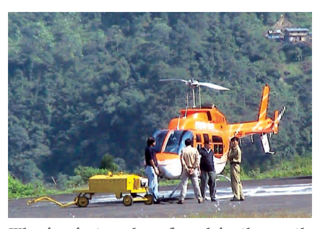
Why is air travel preferred in the northeastern states?

The air travel, today, is the fastest, most comfortable and prestigious mode of transport. It can cover very difficult terrains