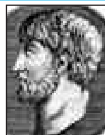
Pierre de Fermat (1601–1665)

The concept of probability developed in a very strange manner. In 1654, a gambler Chevalier de Mere, approached the well-known 17th century French philosopher and mathematician Blaise Pascal regarding certain dice problems. Pascal became interested in these problems, studied them and discussed them with another French mathematician, Pierre de Fermat. Both Pascal and Fermat solved the problems independently. This work was the beginning of Probability Theory.