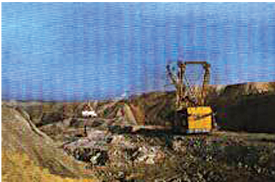
Fig. 5.2: A coal mine

When heated in air, coal burns and produces mainly carbon dioxide gas.