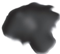
Fig. 5.3: Coal tar

It is a black, thick liquid (Fig. 5.3) with an unpleasant smell. It is a mixture of