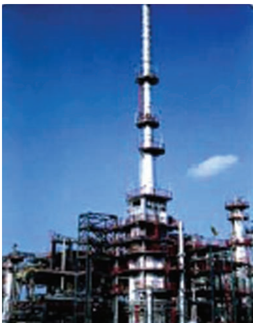
Fig. 5.5: A petroleum refinery

separating the various constituents/ fractions of petroleum is known as refining. It is carried out in a petroleum refinery (Fig. 5.5).