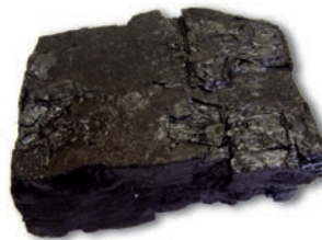
Fig. 5.1: Coal

You may have seen coal or heard about it (Fig. 5.1). It is as hard as stone and is black in colour.