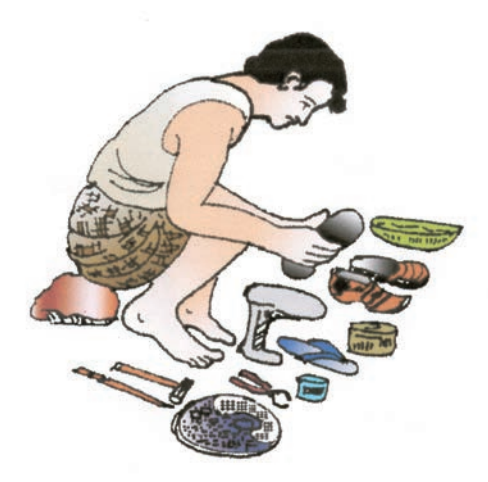
Picture 2.6 Can you remember how much did you pay when you asked him to mend your shoes or slippers?

seems forced upon them. They may therefore want other work of their choice. Poor people cannot afford to sit idle. They tend to engage in any activity irrespective of its earning potential. Their earning keeps them on a bare subsistence level.