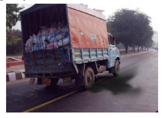
Fig. 18.3 : Air pollution due to automobiles

Vehicles produce high levels of pollutants like carbon monoxide, carbon dioxide, nitrogen oxides and smoke (Fig. 18.3). Carbon monoxide is produced from incomplete burning of fuels such as petrol and diesel. It is a poisonous gas. It reduces the oxygen-carrying capacity of the blood.