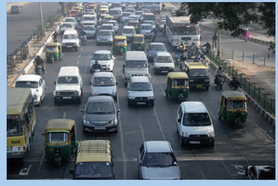
Fig. 18.1 : A congested road in a city