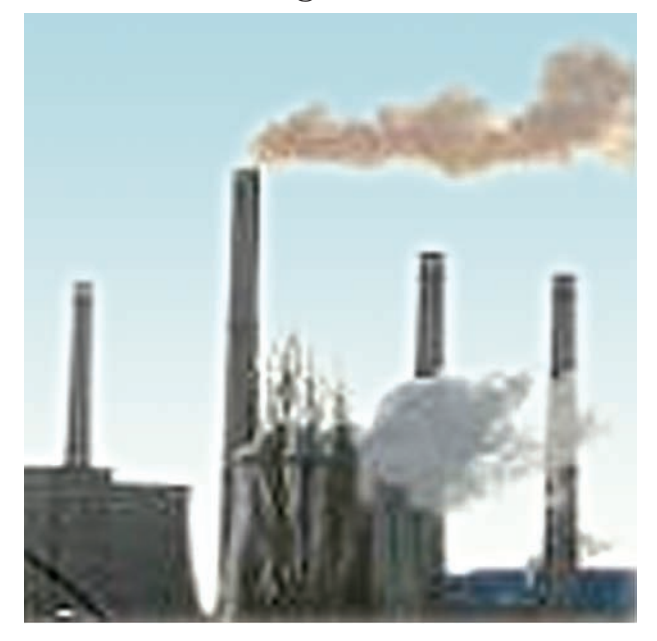
Fig. 18.2 : Smoke from a factory

The substances which contaminate the air are called air pollutants . Sometimes, such substances may come from natural sources like smoke and dust arising from forest fires or volcanic eruptions. Pollutants are also added to the atmosphere by certain human activities. The sources of air pollutants are factories (Fig. 18.2), power plants, automobile exhausts and burning of firewood and dung cakes.