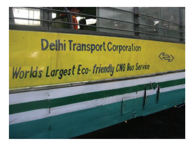
Fig. 18.5 : A public transport bus powered by CNG

There are many success stories in our fight against air pollution. For example, a few years ago, Delhi was one of the most polluted cities in the world. It was being choked by fumes released from automobiles running on diesel and petrol. A decision was taken to switch to fuels like CNG (Fig. 18.5) and