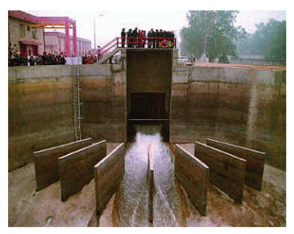
Fig. 18.10 : Water treatment plant

water used for washing vegetables may be used to water plants in the garden.