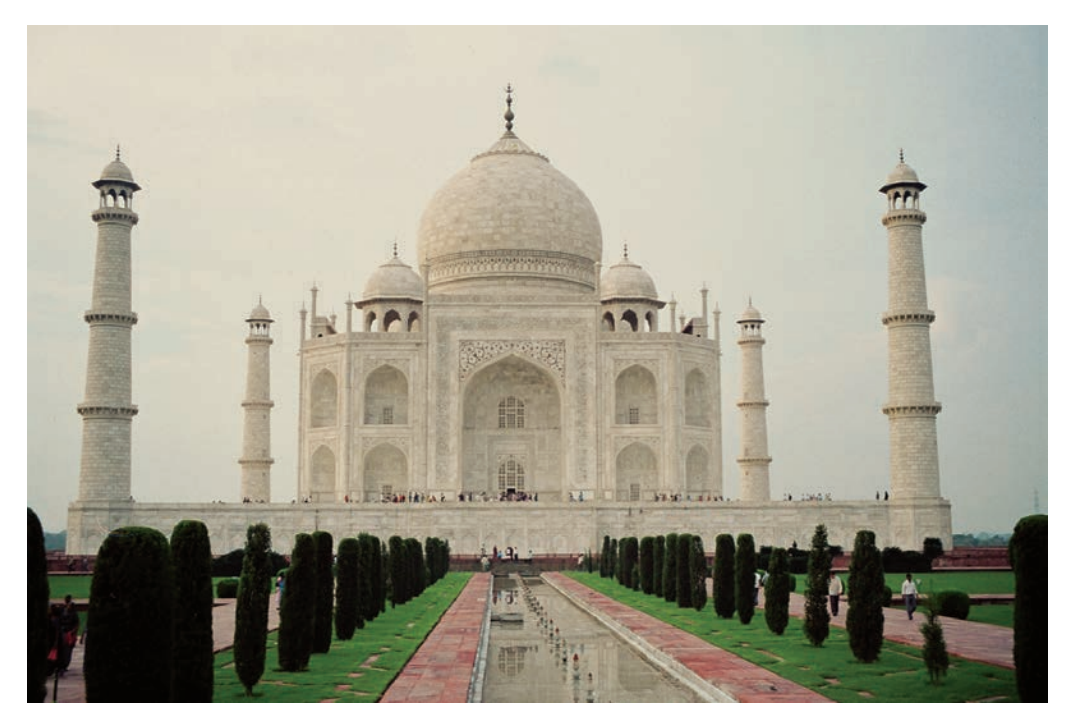
Fig. 18.4 : Taj Mahal

ordered industries to switch to cleaner fuels like CNG (Compressed Natural Gas) and LPG (Liquefied Petroleum Gas). Moreover, the automobiles should switch over to unleaded petrol in the Taj zone.