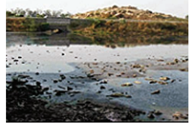
Fig. 18.9 : Industrial waste discharged into a river