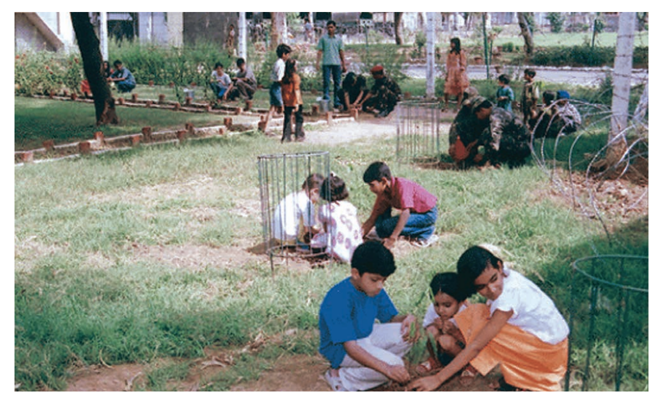
Fig. 18.6 : Children planting saplings

Small contributions on our part can make a huge difference in the state of the environment. We can plant trees and nurture the ones already present in the neighbourhood. Do you know about Van Mahotsav , when lakhs of trees are planted in July every year (Fig. 18.6)?