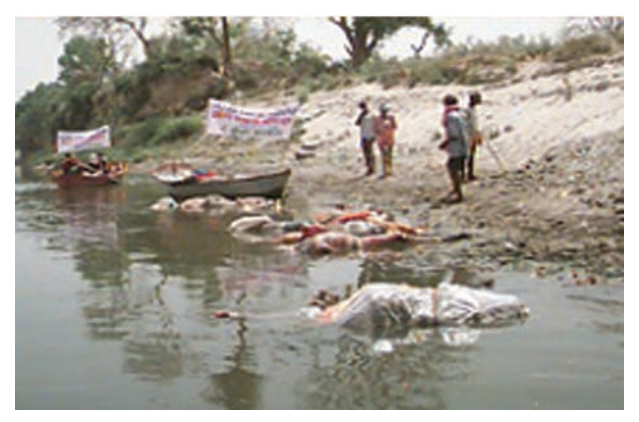
Fig. 18.8 : A polluted stretch of the river Ganga

Many industries discharge harmful chemicals into rivers and streams, causing the pollution of water (Fig. 18.9). Examples are oil refineries, paper factories, textile and sugar mills