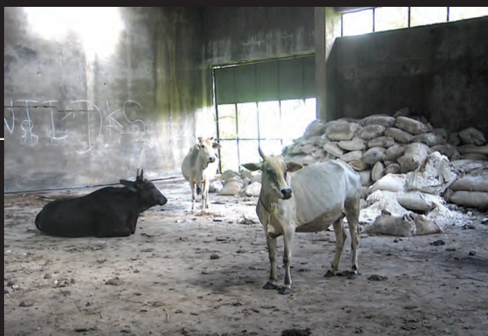
Bags of chemicals lie strewn around the UC plant

UC stopped its operations, but left behind tons of toxic chemicals. These have seeped into the ground, contaminating water. Dow Chemical, the company who now owns the plant, refuses to take responsibility for clean up.