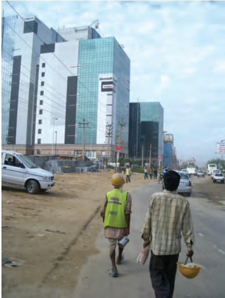
Accidents are common to construction sites. Yet, very often, safety equipment and other precautions are ignored.