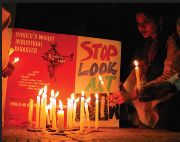
The struggle for justice goes on...

24 years later, people are still fighting for justice: for safe drinking water, for health-care facilities and jobs for the people poisoned by UC. They also demand that Anderson, the UC chairman who faces criminal charges, be prosecuted.