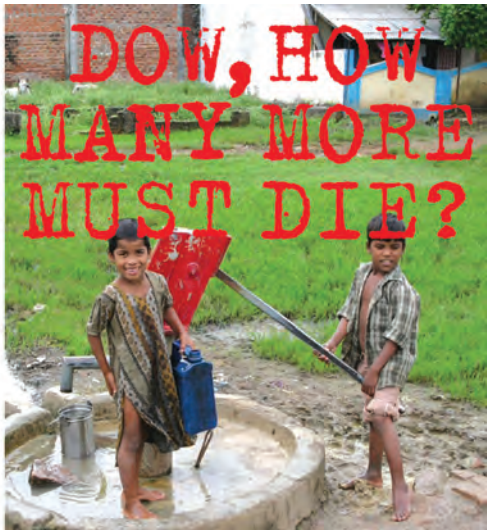
Pumps at contaminated wells are painted red by the government around the UC factory in Bhopal. Yet, local people continue to use them as they have no other accessible source of clean water.

In 1984, there were very few laws protecting the environment in India, and there was hardly any enforcement of these laws. The environment was treated as a 'free' entity and any industry could pollute the air and water without any restrictions. Whether it was our rivers, air, groundwater - the environment was being polluted and the health of people disregarded.