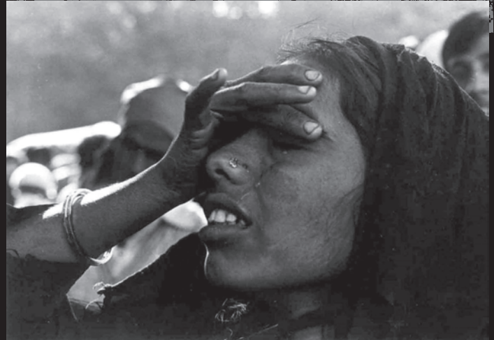
The next morning