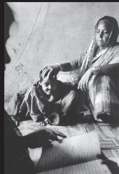
A child severely affected by the gas

Most of those exposed to the poison gas came from poor, working-class families, of which nearly 50,000 people are today too sick to work. Among those who survived, many developed severe respiratory disorders, eye problems and other disorders. Children developed peculiar abnormalities, like the girl in the photo.