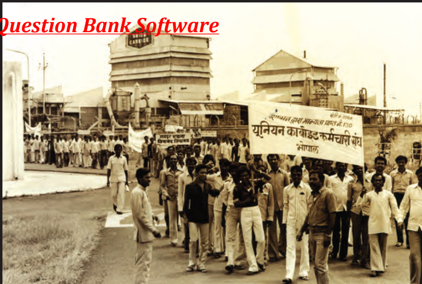
Members of UC Employees Union protesting

The disaster was not an accident. UC had deliberately ignored the essential safety measures in order to cut costs. Much before the Bhopal disaster, there had been incidents of gas leak killing a worker and injuring several.