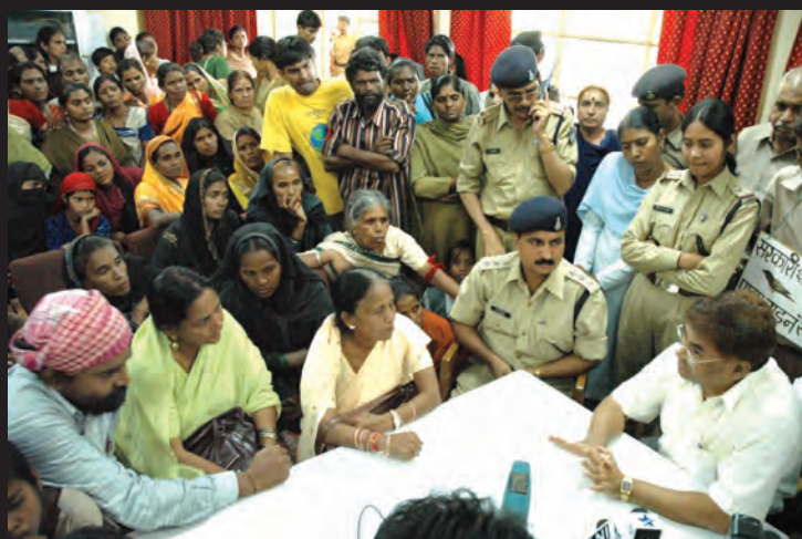
Gas victims with the Gas Relief Minister

Despite the overwhelming evidence pointing to UC as responsible for the disaster, it refused to accept responsibility.