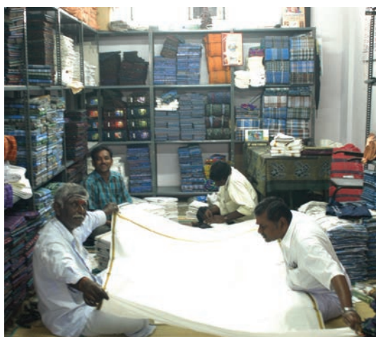
A shop in Erode.

Erode's bi-weekly cloth market in Tamil Nadu is one of the largest cloth markets in the world. A large variety of cloth is sold in this market. Cloth that is made by weavers in the villages around is also brought here for sale. Around the market are offices of cloth merchants who buy this cloth. Other traders from many south Indian towns also come and purchase cloth in this market.