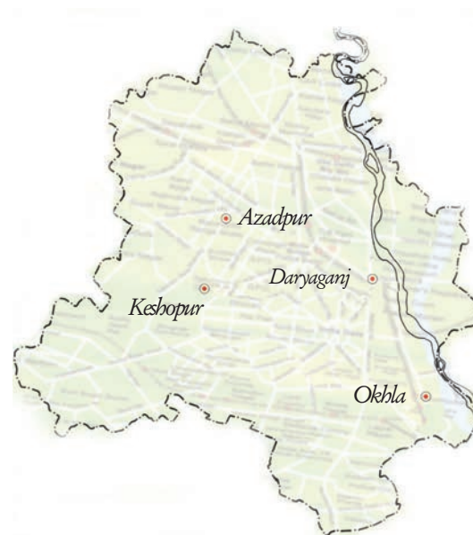
The above map of Delhi shows four of the 10 wholesale markets in the city.

Every city has areas for wholesale markets. This is where goods first reach and are then supplied to other traders. The roadside hawker whom you read about earlier would have purchased a large quantity of plastic items from a wholesale trader in the town. He, in turn, might have bought these from another, even bigger wholesale trader in the city. The city