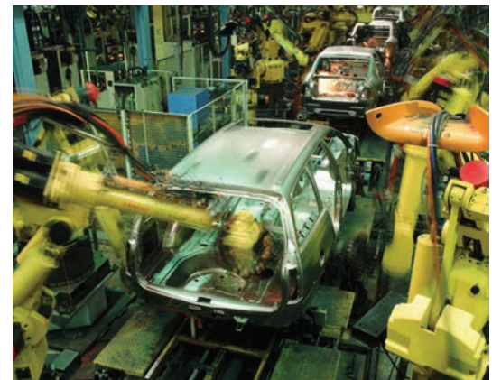
A car being put together in a factory.

We have also examined the chain of markets that is formed before goods can reach us. It is through