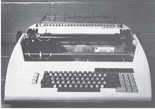
With electronic typewriters, journalism underwent a sea-change in the 1940s.

distances through satellites and cables. This allows us to view news and entertainment channels from other parts of the world. Most of the cartoons that you see on television are mostly from Japan or the United States. We can now be sitting in Chennai or Jammu and can see images of a storm that has hit the coast of Florida in the United States. Television has brought the world closer to us.