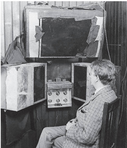
John L. Baird sits in front of the apparatus with which he demonstrated to the Royal Institute, his invention, the 'televisor', an early television.

The different technologies that mass media use are expensive. Just think about the TV studio in which the newsreader sits – it has lights, cameras, sound recorders, transmission satellites, etc., all of which cost a lot of money.