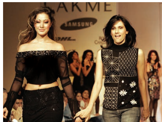
Fashion shows are very popular with the media.

As citizens of a democracy, the media has a very important role to play in our lives because it is through the media that we hear about issues related