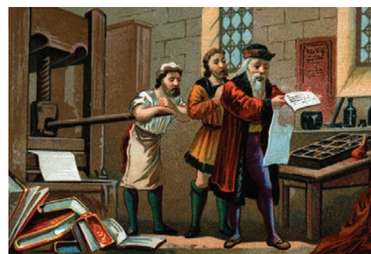
An artist's impression of Gutenberg printing the first sheet of the Bible.

Changing technology, or machines, and making technology more modern, helps media to reach more people. It also improves the quality of sound and the images that you see. But technology does more than this. It also changes the ways in which we think about our lives. For example, today it is quite difficult for us to think of our lives without television. Television has enabled us to think of ourselves as members of a larger global world. Television images travel huge