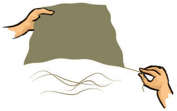
Fig. 3.3 Pulling a thread from a fabric

yarns are visible, you can gently pull one out with a pin or a needle.