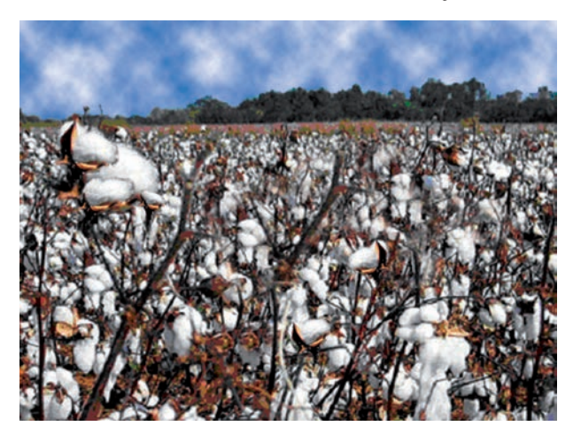
Fig.3.6 Field of cotton plants

Where does this cotton wool come from? It is grown in the fields. Cotton plants are usually grown at places having black soil and warm climate. Can you name some states of our country where cotton is grown? The fruits of the cotton plant ( cotton bolls ) are about the size of a lemon. After maturing, the bolls burst open and the seeds covered with cotton fibres can be seen. Have you ever