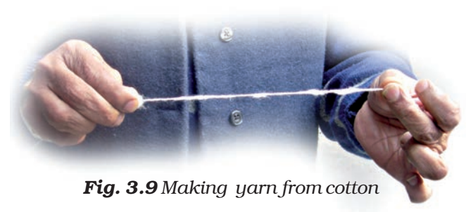
To make fabrics, all these fibres are first converted into yarns . How is it done?