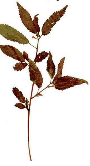
Fig. 3.8 A jute plant

mainly grown in West Bengal, Bihar, and Assam. The jute plant is normally harvested when it is at flowering stage. The stems of the harvested plants are immersed in water for a few days. The stems rot and fibres are separated by hand.