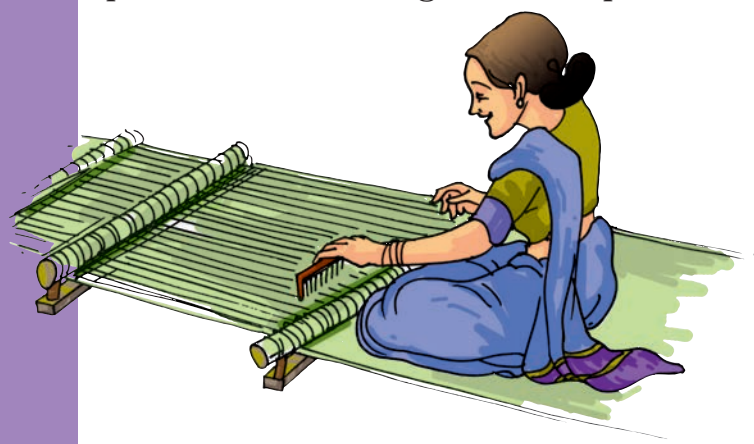
Fig. 3.13 Handloom

Fig 3.12 (a) and on the other as shown in Fig.3.12 (b). Cut both the sheets along the dotted lines and then unfold. Weave the strips one by one through the cuts in the sheet of paper as shown in Fig.3.12 (c). Fig. 3.12 (d) shows the pattern after weaving all the strips.