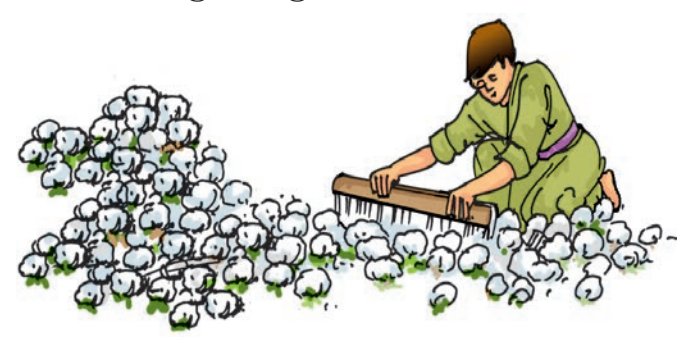
Fig. 3.7 Ginning of cotton

From these bolls, cotton is usually picked by hand. Fibres are then separated from the seeds by combing. This process is called ginning of cotton. Ginning was traditionally done by hand (Fig.3.7). These days, machines are also used for ginning.