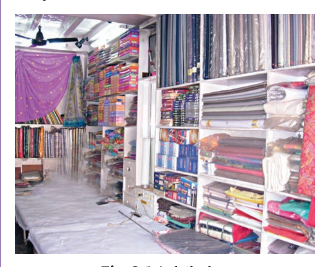
Fig. 3.1 A cloth shop

After their visit to the cloth shop, Paheli and Boojho began to notice various fabrics in their surroundings. They found that bed sheets, blankets,