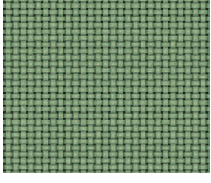
Fig.3.2 Enlarged view of a piece of fabric

Collect cuttings of fabrics leftover after stitching. Feel and touch each piece of fabric. Now, try to label some of the fabrics as cotton, silk, wool or synthetic after