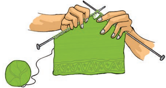
Fig 3.14 Knitting

Have you noticed how sweaters are knitted? In knitting , a single yarn is