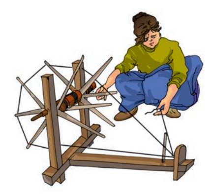
Fig. 3.11 Charkha

A simple device used for spinning is a hand spindle, also called takli (Fig. 3.10). Another hand operated device used for spinning is charkha (Fig. 3.11). Use of charkha was popularised by Mahatma Gandhi as part of the Independence movement. He Fig. 3.10 encouraged people to wear A Takli