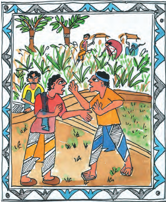
A Quarrel in the Village

There are more than six lakh villages in India. Taking care of their needs for water, electricity, road connections, is not a small task. In addition to this, land records have to be maintained and conflicts too need to be dealt with. A large machinery is in place to deal with all this. In this chapter we will look at the work of two rural administrative officers in some detail.