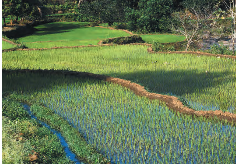
Transplanted paddy growing in a few of Ramalingam's 20 acres. A result of hard labour performed by agricultural workers like Thulasi.

This is when we can say they are caught in debt. In recent years this has become a major cause of distress among farmers. In some areas this has also resulted in many farmers committing suicide.