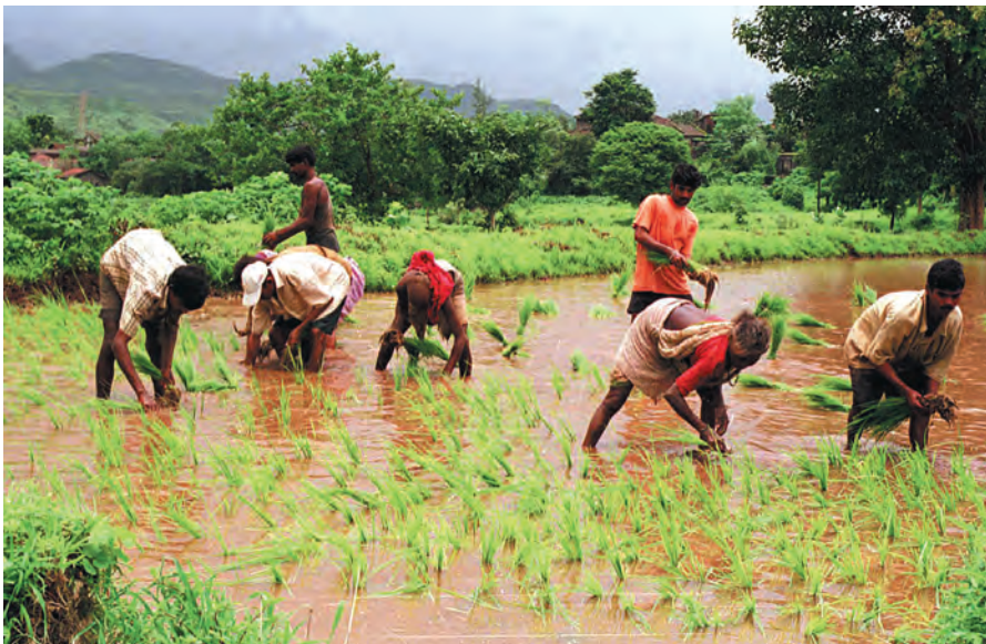
Transplanting paddy is back-breaking work.

The village is surrounded by low hills. Paddy is the main crop that is grown in irrigated lands. Most of the families earn a living through agriculture.