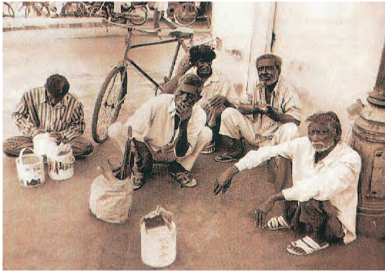
At labour chowk, daily wage workers wait with their tools for people to come and take them for work.

trucks in the market, dig pipelines and telephone cables and also build roads. There are thousands of such casual workers in the city.